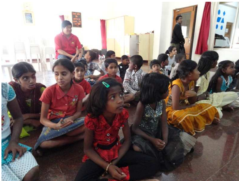
Early birds waiting for the VBS

Personally, I felt that this mission trip was very fulfilling. From the 16-17 December 2011, we attended Covenant BPC (India)'s first family and youth retreat. Although I did not sit through all the messages, I heard from many others that the messages being taught was very solid. I was helping out for the children's ministry where we taught approximately 15 kids the different names of God (Elohim, Jehovah, Creator, Adonai). The children were all so responsive and attentive during singspiration and while listening to the bible story and I am sure they took home the message intended for them, together with the lovely crafts that they made.