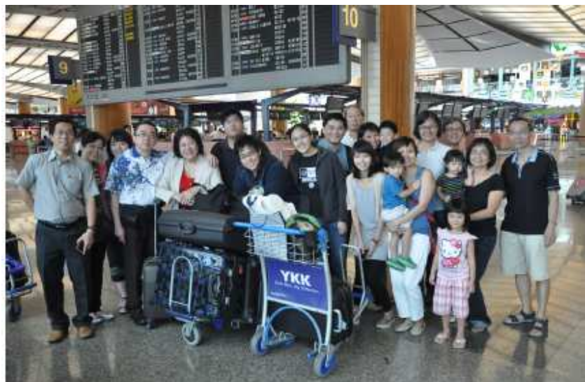
The Mission Team and loved ones before departure

The Mission Team had initially wanted to book the dates of 14-20 December for the trip by flying with SilkAir. As the team were preparing before the actual date, the price of the air tickets had been increasing daily; and especially on 20 December where the