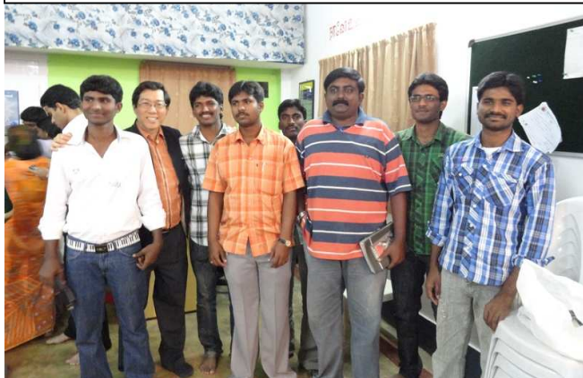
New friend and members at NCBPCI

The Gospel of Jesus Christ and the doctrine of Predestination was faithfully proclaimed from the book of (Isa 7:14 and 9:6) and (Rom 8:28-30). Please do pray for the enlightening work of the Holy Spirit; that many would believe in Christ by the saving grace of God.