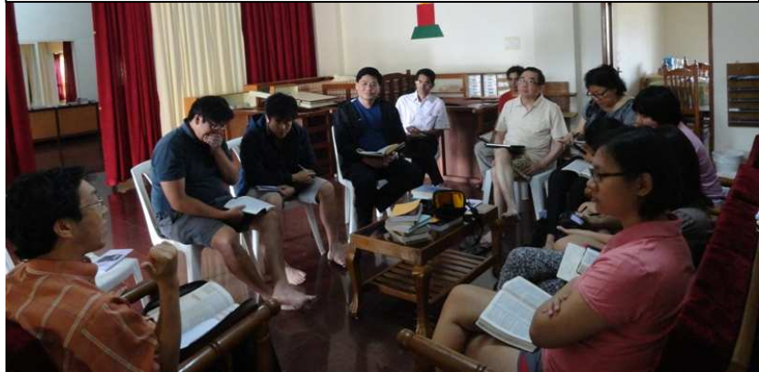
Morning devotion with the word and prayer

blessed and thoroughly enriching mission trip to Covenant BPC, Bangalore.