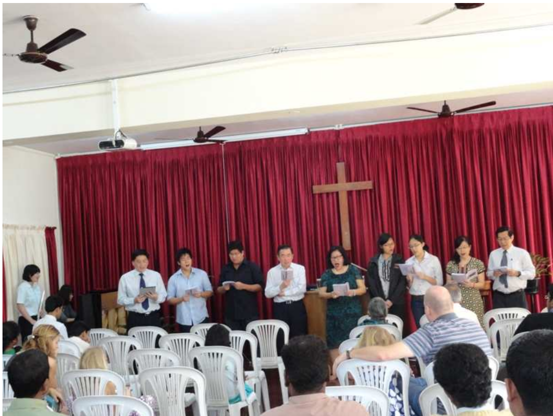
Song presentation by the mission team